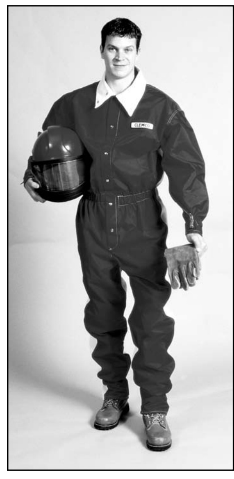
Clemco Seasonal Light-Duty Blast Suit